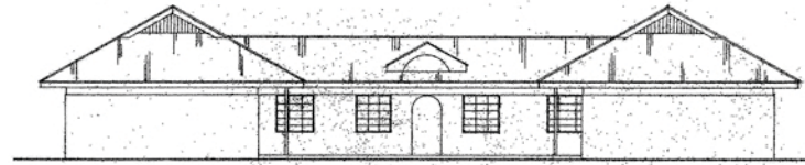
ELEVATION - 02