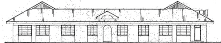
ELEVATION - 03